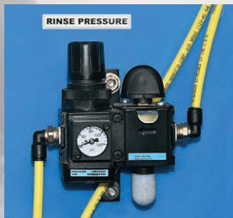
Rinse Pressure Gauge