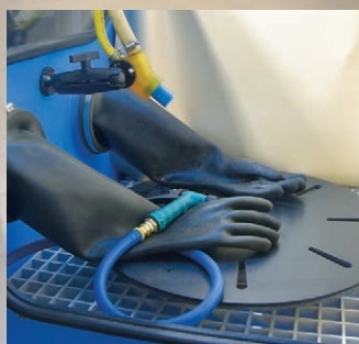
Glove Ports, Turntable, Manual Blast Nozzle