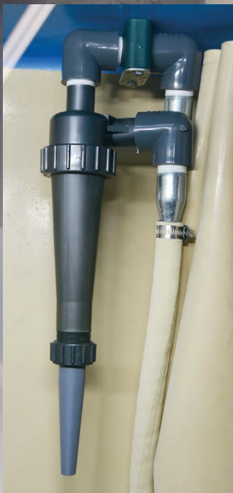
Manual Rinse Gun