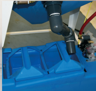
Buckets with Bag Filter (Upgrade)